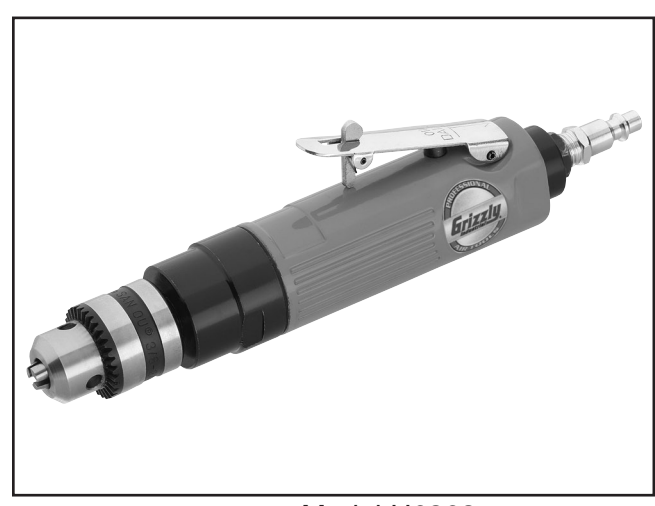
Figure 1. Model H6363.